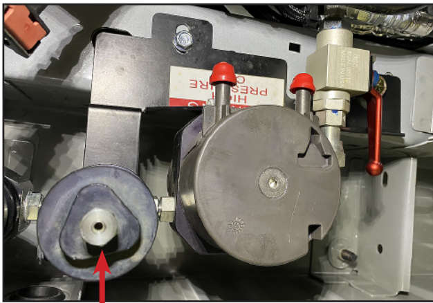
Bleeder Valve Plug on Transit. Under the vehicle and driver door.