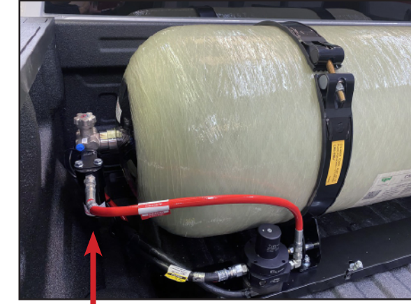
Bleeder Valve Plug on Trucks. In bed of truck under cylinder cover.